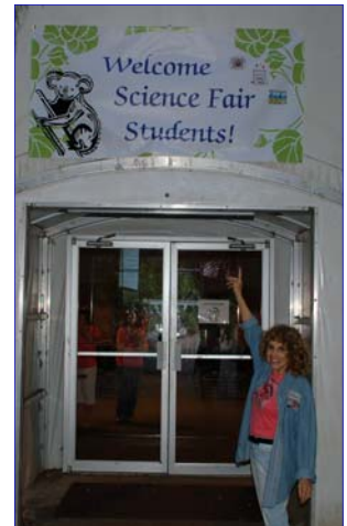
(Continued on page 6)

The purpose of the Very Special Science Fair is to enable students with significant disabilities the opportunity to participate in scientific inquiry and discovery. Each classroom develops a science project which is displayed at the Palm Beach Zoo's facility. Science Fair projects follow standard Science Fair protocol.