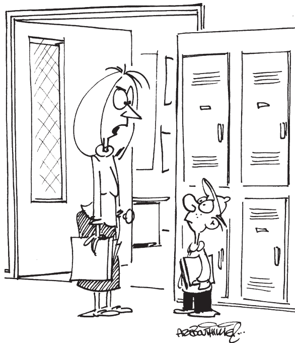
"I know I'm your favorite teacher, but please stop sending me 'Facebook friend' requests!"

A few years into the strategy, the leadership team knew they needed to help teachers and principals develop more sophisticated skills in order to break the links between race and achievement. They also