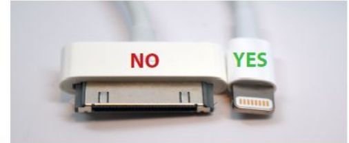
30 Pin Dock - NO ; Lightning Connector - YES

NOTE: iPad minis, iPhones, and other tablets are not supported for use with i-Ready for Students app