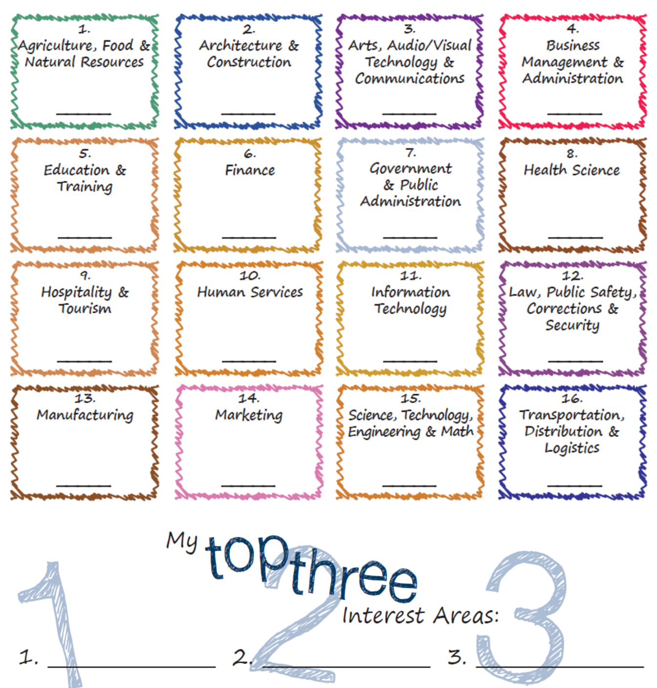
As you can see, the interest survey is divided into 16 groups. Each group is a career cluster . Career clusters place similar occupations in groups. These clusters help you narrow the thousands of career options in the world to a general area of interest. The clusters connect what you learn in school to the skills and knowledge you need beyond high school. Some careers are placed in more than one cluster.