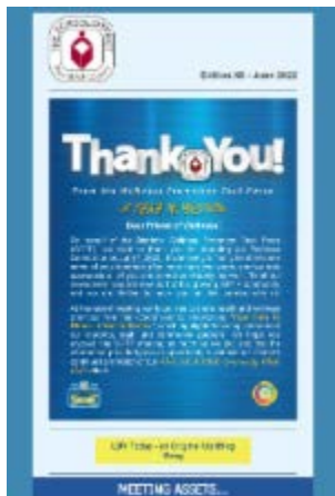
'Wellness Promotion: District and Community Updates' Newsletters...being 'Wellness Activists' (FY22)