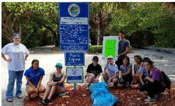
Boca High's Environmental Club The Great American Cleanup