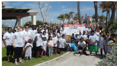
Highland Elementary The Great American Cleanup