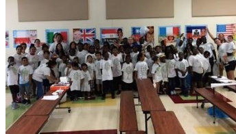
Forest Park Elementary The Great American Cleanup