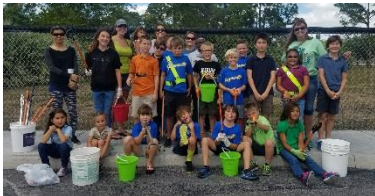
Royal Palm Beach Elementary The Great American Cleanup